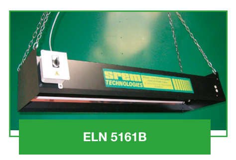
UV-A tubes for Penetrant Testing and Magnetic Particle Inspection -

5 UV-A tubes + 1 White Light tube - Lenght 600mm