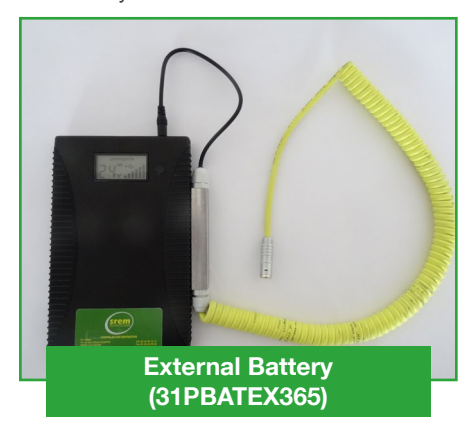
Ultra-flat and light, it gives the lamp more autonomy, up to 8 hours in continuous supply