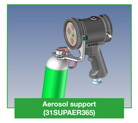
Light and spray with one hand ! Easy fastening and unfastening