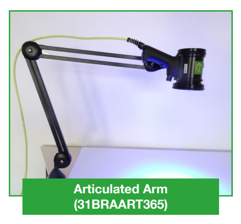
You can maintain the lamp in a fixed position. Quick fastening and unfastening