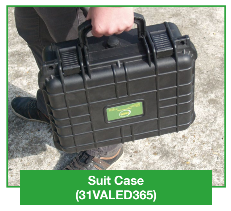
Solid and light, you can put the lamp inside for secured transportation