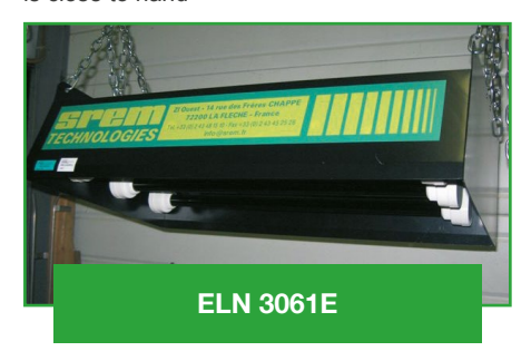
UV-A tubes for Penetrant Testing and Magnetic Particle Inspection - Waterproof - Ideal for the rinse tank in penetrant testing.

3 UV-A tubes - Lenght 600mm - White Light in option.