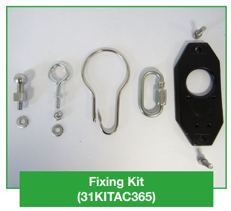
You do not know where to put your lamp? We have the solution for hanging and fixing it so it is close to hand