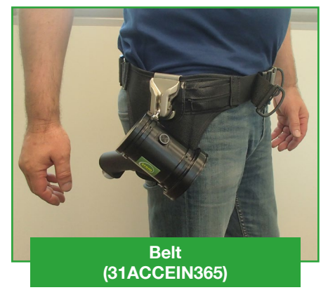
Discreet and light adjustable belt for more comfort. You can firmly attach the battery model without any fall risk thanks to the security system. It gives the operator the possibility to move freely.

A wide range of accessories (belt, extension cable, reloading stand, external battery, articulated arm, suitcase, universal fastening kit, and adaptor for camera) allows for filling any needs while making the control easier and improving the operator's comfort.