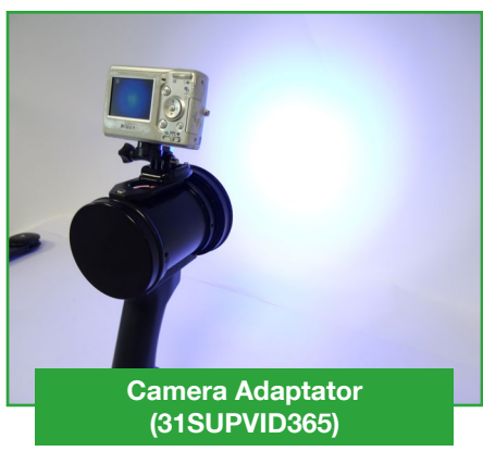
You can attach a camera on the hull, very useful for expert assessment with documentation