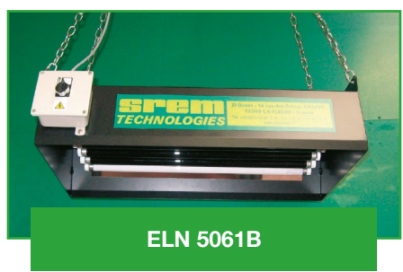
UV-A tubes for Penetrant Testing and Magnetic Particle Inspection -

3 UV-A tubes - Lenght 600mm - White Light in option.