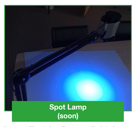
Lamp without handle on articulated arm. Performance is identical to S-LED lamps. No timed functioning